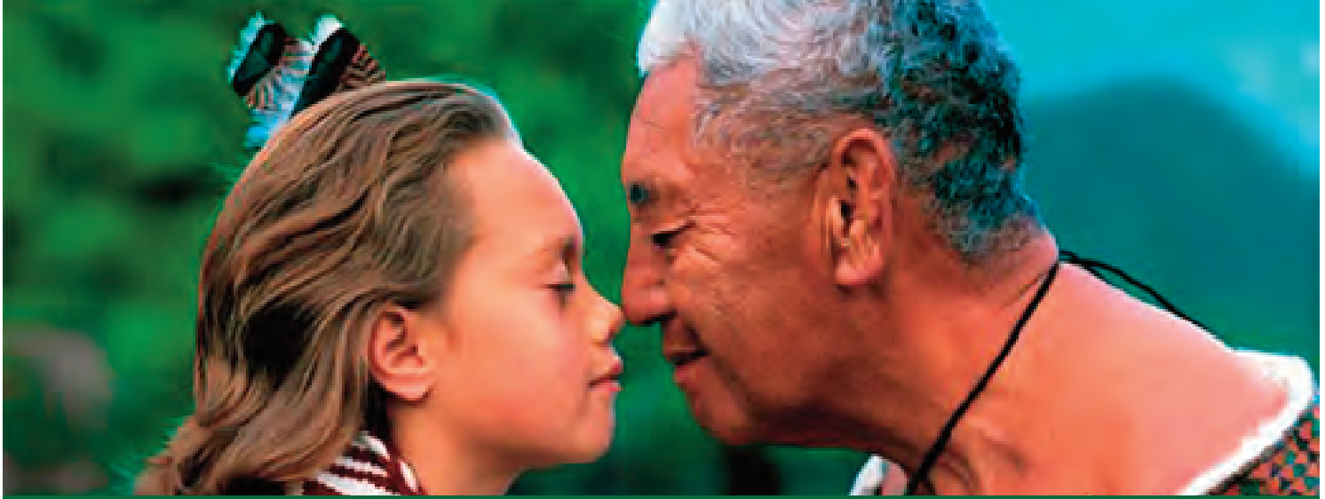
Maori Elder and young girl sharing “Ha”